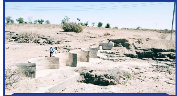
Ferrocement Dam prepared by Reliance Foundation

This event was organized by Reach2Root at R K University on 5th to 7th April 2019, which was attended by the faculties and students of B H Gardi College of Engineering and Technology . This event was organized in two parts one day of lecture series and two days for village visit.