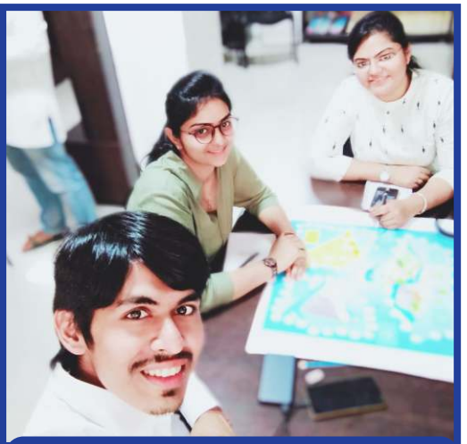
Playing Masti - A Life Simulation Game