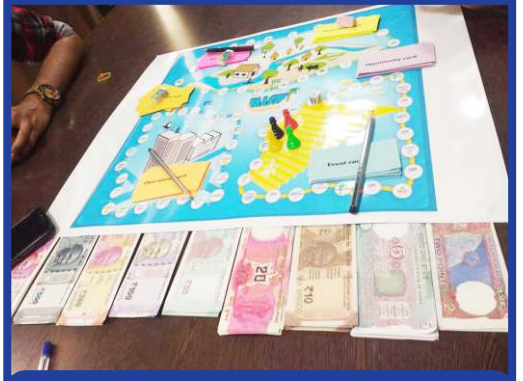
Masti - A Life Simulation Game