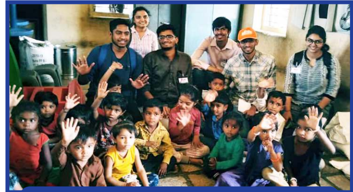
Visited Anganwadi at village - Vankiya