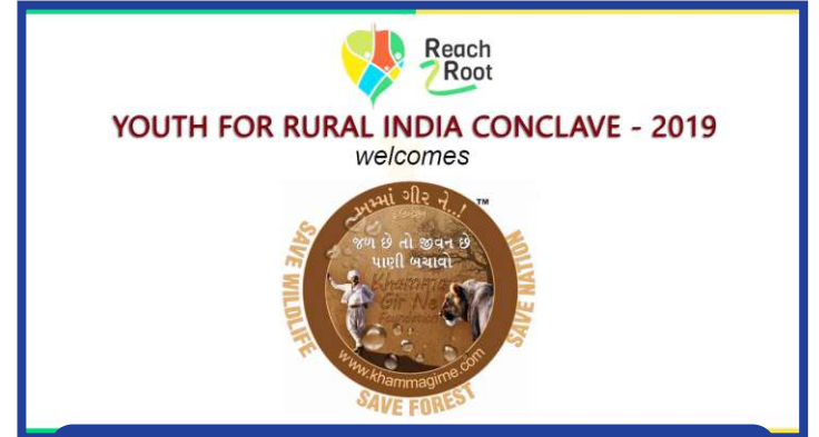
YFRI 2019 Organised by Reach2Root