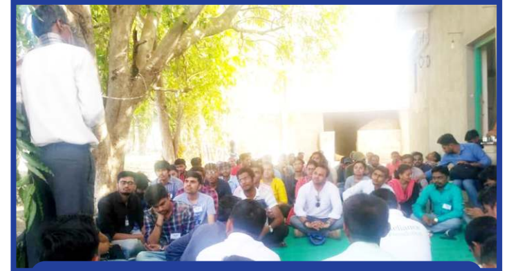
Interaction with Villagers

On day 2 village visit was organized at Vakiya, Sukhpar and Fulzar . During this visit they learned what kind of problems they were facing and how they had found the way to overcome it? Their main problems are water, sanitation, education, agriculture, malnutrition etc. With the help reliance foundation they had built many check dams and water tanks using ferrocement to solve the problem of water. They formed farmers' producers' company to get proper price for their crop.